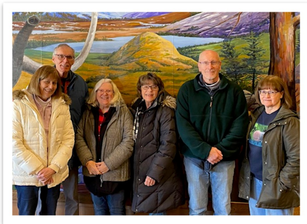
Trillium group at the Ice Age Trail Visitor Center.