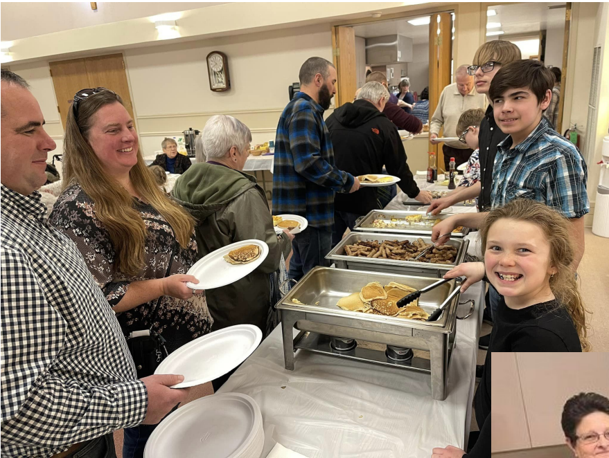
Palm Sunday Breakfast